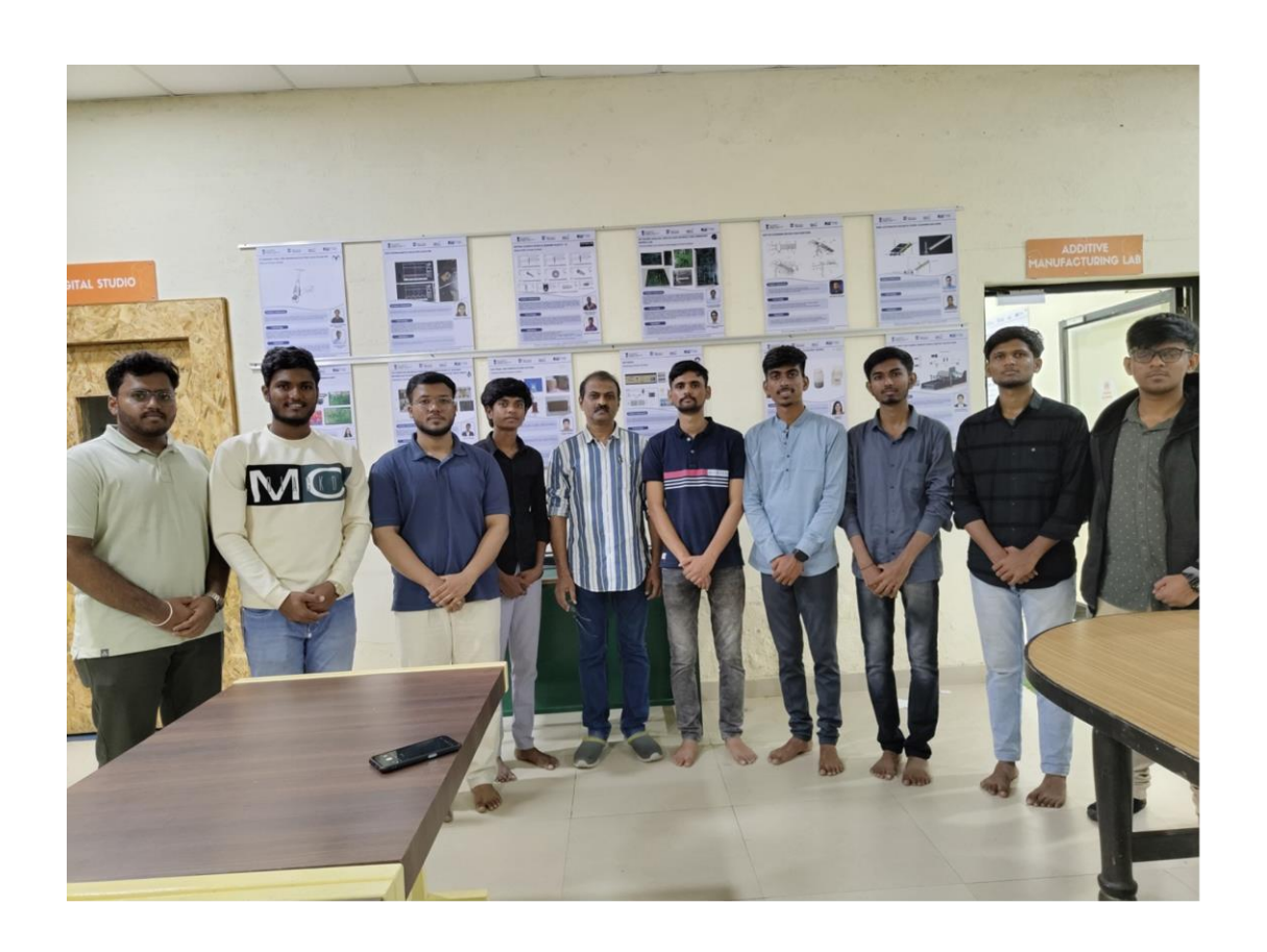
Boot Camp SPIT, Mumbai

4<sup>th</sup>-6<sup>th</sup> Dec 2024 ,Sardar Patel Institute of Technology. Mumbai