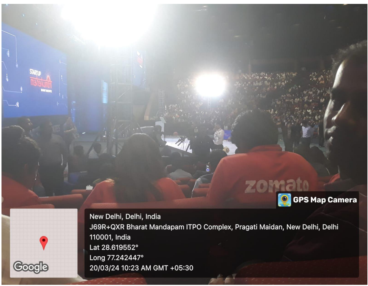
18^{\text{th}} to 20^{\text{th}} March 2024 , Bharat Mandapam ,New Delhi