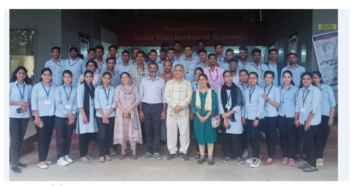
SPIT visit 8/8/2023 35 Students and 3 faculty members